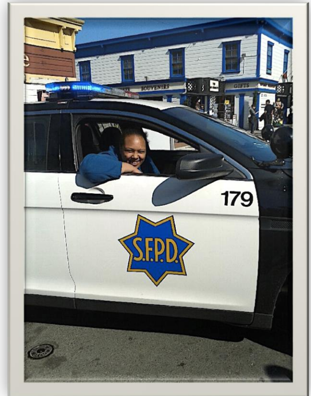
Fun visit with the S.F.P.D