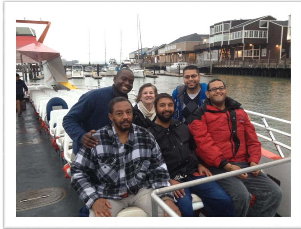
A Community Outing