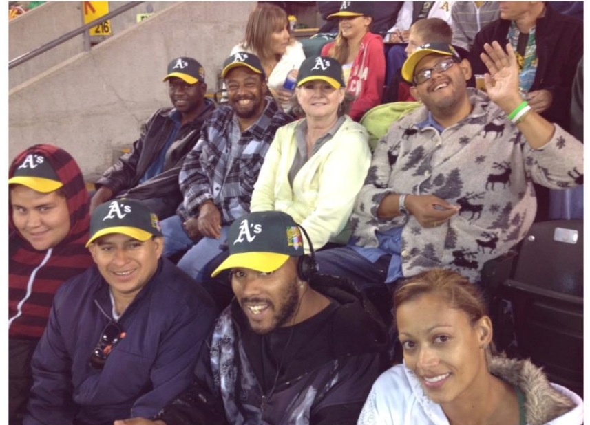
Clients and Staff enjoying a baseball game