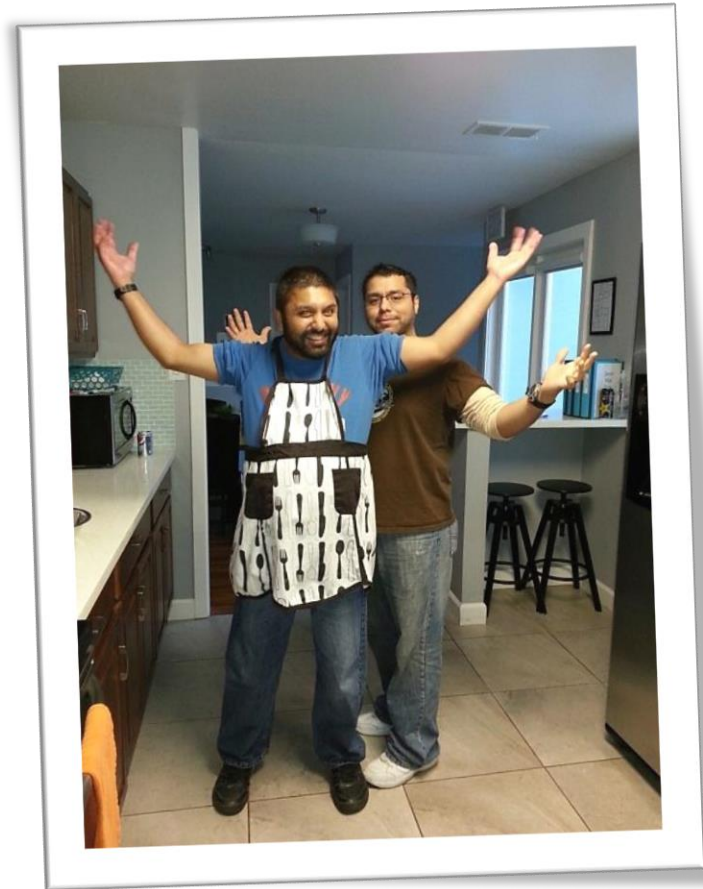
Supported Living Services (SLS)